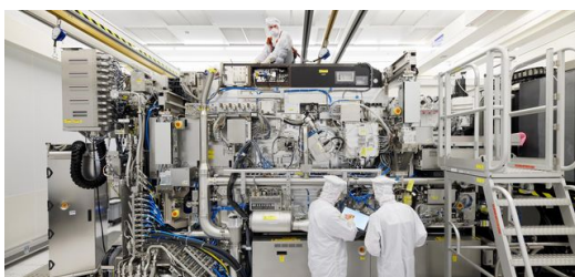
ASML employees working on a new generation of the EUV lithography system NXE3400B.