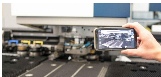
Remote diagnosis and error correction using the Visual Assistance function integrated into the TRUMPF Service app allows TRUMPF technicians to connect to the customer's cell phone or tablet camera.