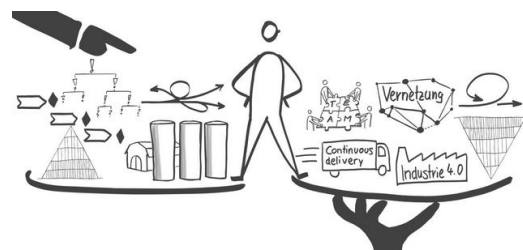
For a flexible organization, you need both stability and agility.