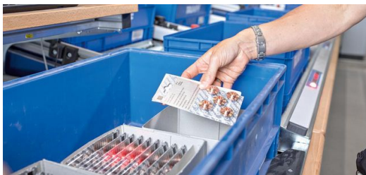
Order Preparation.