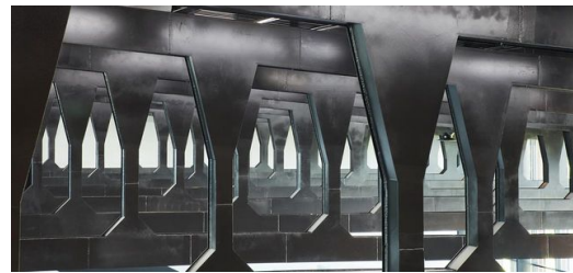
Der Skywalk ist Teil der frei tragenden Deckenstruktur aus Stahl, die von einem TRUMPF Kunden in Atlanta gefertigt wurde.