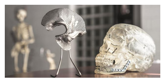
What the eye can't see: the surfaces 3D printing can produce are the key to promoting a connection between the bone and the implant.