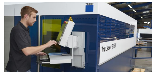
Christoph Siegl is particularly impressed by the Drop&Cut function, an unrivaled solution for quick post-production.

In spite of the fact that another machine tool manufacturer was close by, the Sigels traveled to the TRUMPF show room in Ditzingen. The quality of the specimen parts was just as convincing as the rugged engineering of the TruLaser 3030 fiber. "The machine is really made for shop use. Every detail has been thought out entirely," acknowledges Christoph Sigel. "I was particularly impressed by the Drop&Cut function, an unrivaled solution for quick post-production." Drop&Cut uses a camera to transmit a live picture of the machine's interior right to the display at the control terminal. A mouse click or touching the screen is su=cient to project the geometry of the desired part onto the remaining plate. Parts can be positioned and turned, inside the camera's field of view, on the sheet metal. Here outlines can be rotated, shifted, copied or deleted as desired. Christoph Sigel: "Post-production couldn't be any easier."