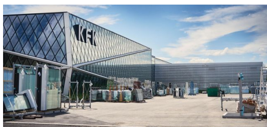
<p>The KFK building in Croatia.</p>

KFK used to focus predominantly on customers from Croatia, but today the company is involved in projects all over the world. "Right now we're focusing on the UK, which is currently experiencing a boom in construction. All the world's big cities are constantly striving to make buildings that are taller, more sophisticated and even better quality, and London is no exception," says Papac. He is particularly proud of the biggest project KFK is working on at the moment: "It's a residential building in London, the tallest structure of its kind currently under construction anywhere in Europe. With 76 floors and at 233 meters tall, it's a project that obviously requires the production of lots and lots of facade modules." It takes several years to complete projects on this scale – three and a half years in this case.