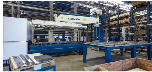
A Stopa storage system takes care of supplying materials while a LiftMaster makes it easier to handle parts.