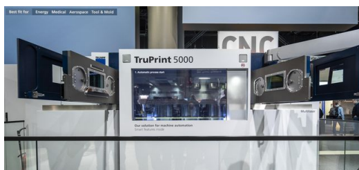
<em><em>The TruPrint 5000 featuring auto-start</em></em>

The large-format TruPrint 5000 system featuring auto-start was an eye-catcher. This solution speeds up 3D printing to boost productivity. The Formnext demo showed visitors how the substrate plate with a zero-point clamping system automatically slides into the proper position. Speaking at the press conference, Tobias Baur, General Manager of TRUMPF Additive Manufacturing, said that automated in-machine solutions like this are the first step toward the longer-term goal of automating upstream and downstream stages in 3D printing.