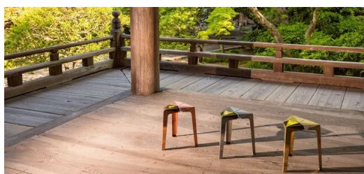
<p>The "Orisu" chair is something special: it makes abstract technologies visible to the viewer.</p>