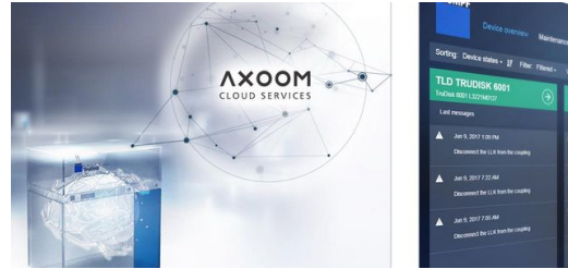
Some of the data is uploaded to the AXOOM Cloud via the Internet.