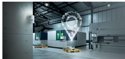
This enables sheet-metal manufacturers to track orders, load carriers and means of transport and thus optimize processes.