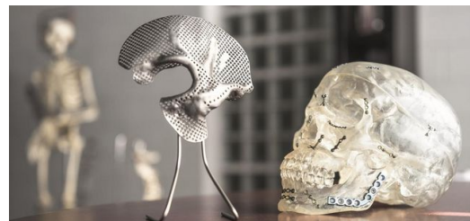
<p>What the eye can’t see: the surfaces 3D printing can produce are the key to promoting a connection between the bone and the implant.</p>