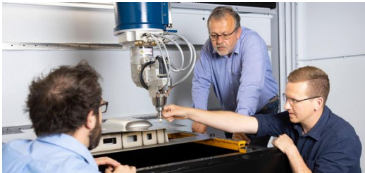
Discussing, arguing and seeking solutions together: the good cooperation between sons and father has taken the company a long way, on course for the Smart Factory.