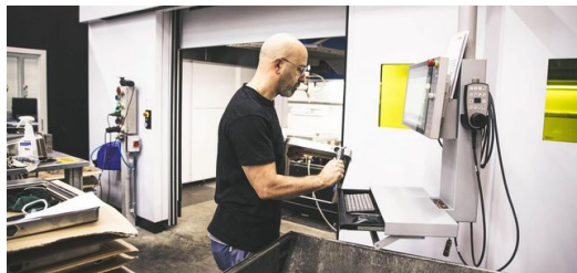
Rieber is a leading supplier of kitchen technology for restaurants and private households. But the company from Reutlingen also produces components and assemblies made of stainless steel and titanium for the aerospace industry. Quality is particularly important here.