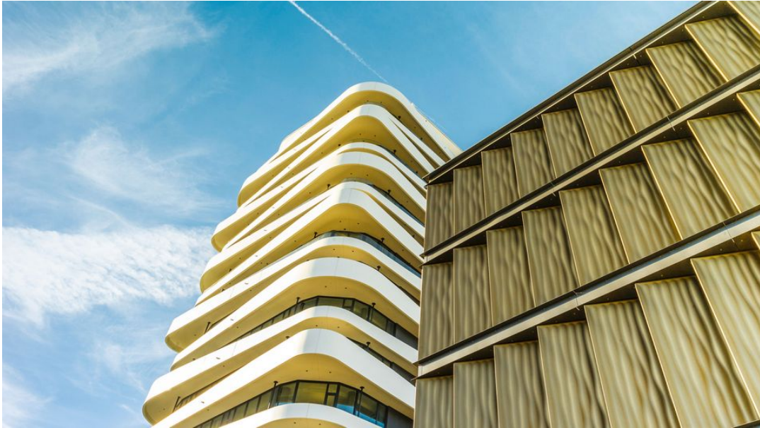
Multistory parking garage in Bietigheim-Bissingen

“Lasers are fast and flexible. We can use our systems for so many different things because they are so quick to reprogram,” says Geiger. TRUMPF demonstrates how these systems work together at its Smart Factory in Chicago. But what would Jean Prouvé have to say about laser machines as he gazed down on Industry 4.0 from the skywalk? Perhaps that he had always known the machine industry was capable of inspiring architecture? Maybe he would even see the TRUMPF Smart Factory as the successful realization of a fusion between industrial architecture and architecture from industry? Or perhaps he would simply be too flabbergasted to speak!