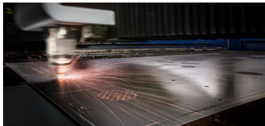
The TruLaser 5030 fiber is powered by a three-kilowatt TruDisk laser and cuts thick and thin sheets of copper and brass, as well as mild steel, stainless steel and aluminum. “It is extremely fast and the non-productive periods, even for our short production runs, are very low,” says Werner Neumann.