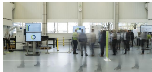
In the Showroom, employees produced a sheet metal part live. Screens displayed important manufacturing information.