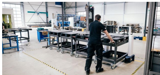
Sensors at the docking station detect when a pallet or pallet cage is parked and report this directly to TRUMPF's TruTops Fab software, which then takes over the automatic transport control.