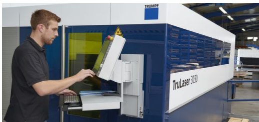
Christoph Sigel is particularly impressed by the Drop&Cut function, an unrivaled solution for quick post-production.

In spite of the fact that another machine tool manufacturer was close by, the Sigels traveled to the TRUMPF show room in Ditzingen. The quality of the specimen parts was just as convincing as the rugged engineering of the TruLaser 3030 fiber. "The machine is really made for shop use. Every detail has been thought out entirely," acknowledges Christoph Sigel. "I was particularly impressed by the Drop&Cut function, an unrivaled solution for quick post-production." Drop&Cut uses a camera to transmit a live picture of the machine's interior right to the display at the control terminal. A mouse click or touching the screen is sufficient to project the geometry of the desired part onto the remaining plate. Parts can be positioned and turned, inside the camera's field of view, on the sheet metal. Here outlines can be rotated, shifted, copied or deleted as desired. Christoph Sigel: "Post-production couldn't be any easier."