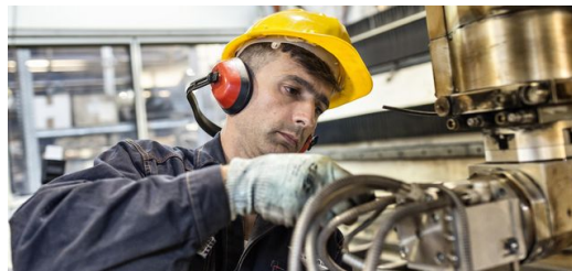
An employee prepares the Lasercell 1005.