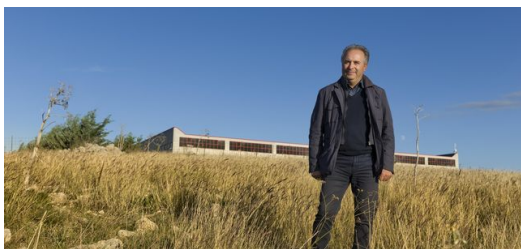
The company ELFIM s.r.l. is situated on a bleak and desolate limestone plateau near Gravina in Puglia.