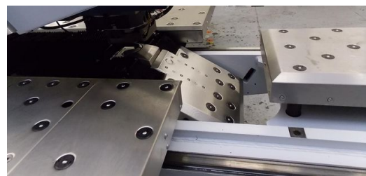
Before and after: old TRUMPF machine after overhaul.