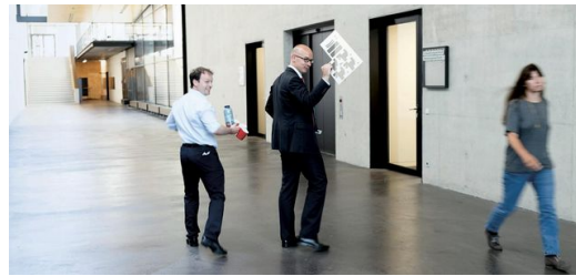
The team of people from the product group, development, purchasing, production, sales, service and project organization departments meets at regular intervals to discuss how development on the TruLaser Center 7030 is progressing.