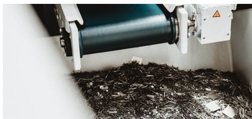
Material-saving: The TruPunch 5000 reduces rejects to a minimum.