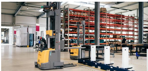
To be able to offer customers a complete solution from a single source, TRUMPF brought a competent partner on board in the form of logistics specialist Jungheinrich. The ERC 213a transport system is connected to TruTops Fab through an interface and handles up to 22 transports per hour.