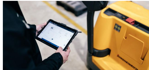
With the help of the intuitive interface of TruTops Fab Logistic, workers can check orders in and out using tablets, even on the shop floor. When an order is reported as completed, TruTops Fab automatically generates a transport order for the automated guided vehicle system.