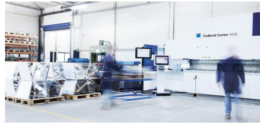
The machinery of the BOZ Group includes a TruBend Center.