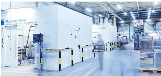
Two laser welding cells connect components to each other.