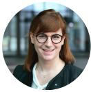
CATHARINA DAUM TRUMPF MEDIA RELATIONS, RZECZNIK PRASOWY

Modern flow drilling methods can almost double the thread count and reduce the required material thickness by 50 percent, as Steinhart explains: "In one project we managed to reduce the material thickness from the original figure of nearly four millimeters to just two millimeters while still achieving a 3.6-millimeter thread depth. That made the pipe design much lighter, offering tangible benefits for the customer's final product and enabling us to offer them the part at a lower price."