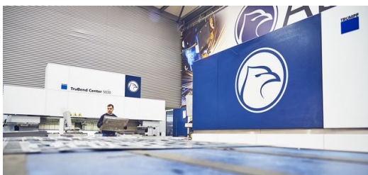
Most up-to-date technologies: Worker with the TruBend Center 5030