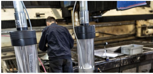
In combination with a powder feeder, the Lasercell 1005 from TRUMPF is also highly suitable for laser metal deposition.

“Strictly speaking, LMD is actually nothing new. It’s a process that has been used for many years now for repairs and coatings. However, we decided to use the process for manufacturing complete components – as is the case with this impeller here.”