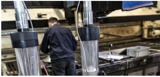
In combination with a powder feeder, the Laser cell 1005 from TRUMPF is also highly suitable for laser metal deposition.

“Strictly speaking, LMD is actually nothing new. It’s a process that has been used for many years now for repairs and coatings. However, we decided to use the process for manufacturing complete components – as is the case with this impeller here.”