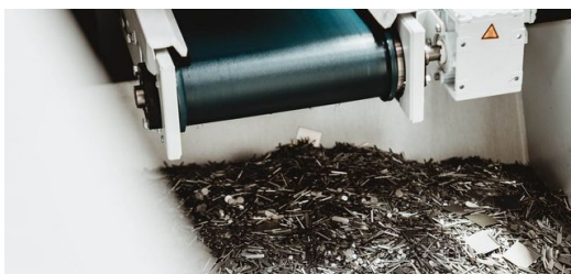
Material-saving: The TruPunch 5000 reduces rejects to a minimum.