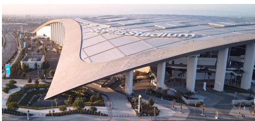
The roof of the SoFi Stadium is light and elegant. The cover made of the translucent plastic ETFE can be opened and closed.

Built at a cost of some 5 billion euros, the SoFi Stadium sports and entertainment complex near Los Angeles, with its event venues, parks and restaurants, is said to be the most expensive stadium in the world. The execution of the project was an extraordinary challenge for TRUMPF and its US customer, architectural engineering company A. Zahner. To build the SoFi, the Kansas City, Missouri-based metalwork experts used three TRUMPF machines to cut and punch 37,000 unique panels featuring some 30 million holes distributed at irregular intervals. This was made possible thanks to a customized software solution developed in Ditzingen.