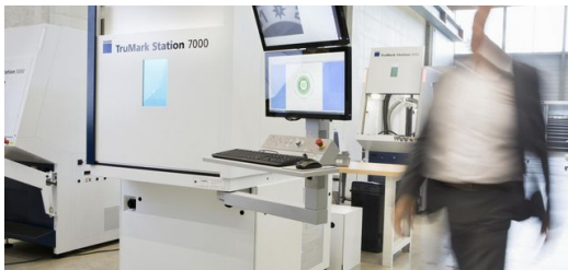
<p><span lang="EN-US">The edition engraving for the Meister S Chronoscope Platinum Edition 160 was created in a TruMark Station 7000 equipped with the new generation TruMicro Mark Series 2000 ultrashort pulse laser.</span></p>

Clearly, everything about this timepiece must be perfect down to the smallest detail. The case, pushers and screw-down crown of the Meister S Chronoscope are made of highly polished platinum. The hour counter of the stopwatch, integrated into the cool silvery shimmering dial, bears the limitation number, as does the watch back. "Each watch is absolutely unique," says Stotz with enthusiasm. "The 12 numbering on the dial and the edition engraving with limitation number on the watch back make it unique. To ensure that this unique selling point is also perfect, we turned to our contact Ralf Motz at TRUMPF."