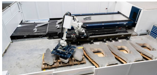
Laser blanking: A robot automatically sorts the cut components.