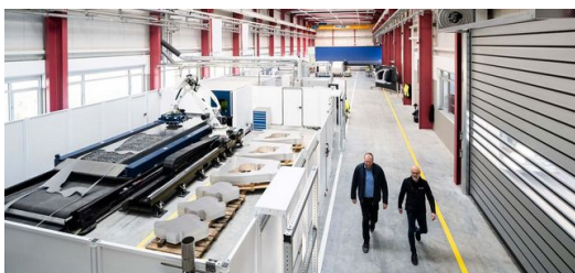
The 34 meter-long laser blanking system from TRUMPF saves unprocessed material and around 4000 tonnes of CO 2 per year.