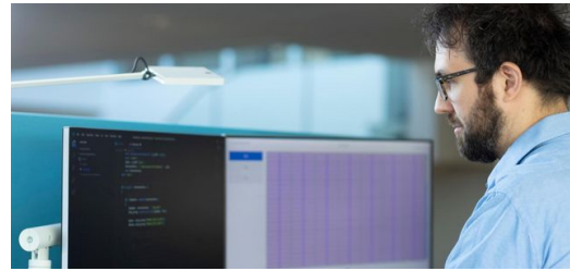
IT specialist Raphael Willgens deliberately opted for an open ERP system: "I programmed many of the optimizations in the upstream and downstream processes myself."