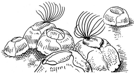
<p>Barnacles (Balanidae) are arthropods that belong to the subphylum Crustacea. These sessile animals live primarily in coastal waters, though some species of barnacle live in deeper regions of the ocean. They use their feather-like appendages to fish for microorganisms and suspended particles.</p> – Jürgen Willbarth / Die Illustratoren