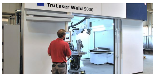
Significant savings: sheet metal fabricator Schink operates its TruLaser Weld 5000 laser welding cell and TruLaser 3040 laser cutting machine in what's known as a laser network. That means the two systems share a 4-kilowatt TruDisk 4001 solid-state laser source.

The Schink sheet metal experts point to the example of the flour duster to illustrate the dimensions of the productivity gains they have achieved. Welding the housing by hand takes about 110 minutes, including some laborious preparations and various finishing steps. With the TruLaser Weld 5000, Schink has introduced a reliable process that gets the same job done in just 10 minutes, including set-up time – and with no finishing work required!