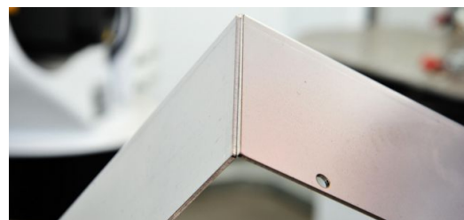
"Tolerant" laser welding is essential for components that have gaps or awkward overlaps. The TruLaser Weld 5000 offers this capability with its optional FusionLine feature.