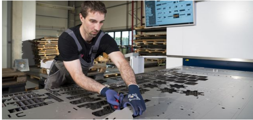
Today, all it takes is a glance at the Sorting Guide screen. The operator is shown a removal proposal on the large screen. All parts that belong to an order are color-coded.