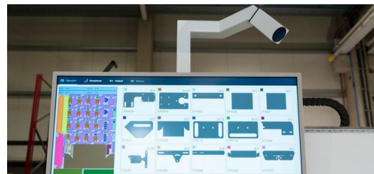
The large screen of the Sorting Guide clearly displays the removal recommendation as well as all parts belonging to an order.