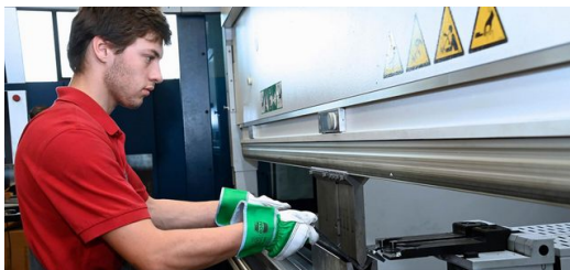
Assistance systems and software help with the work: The TruBend 5230 in use at the Fischer company.