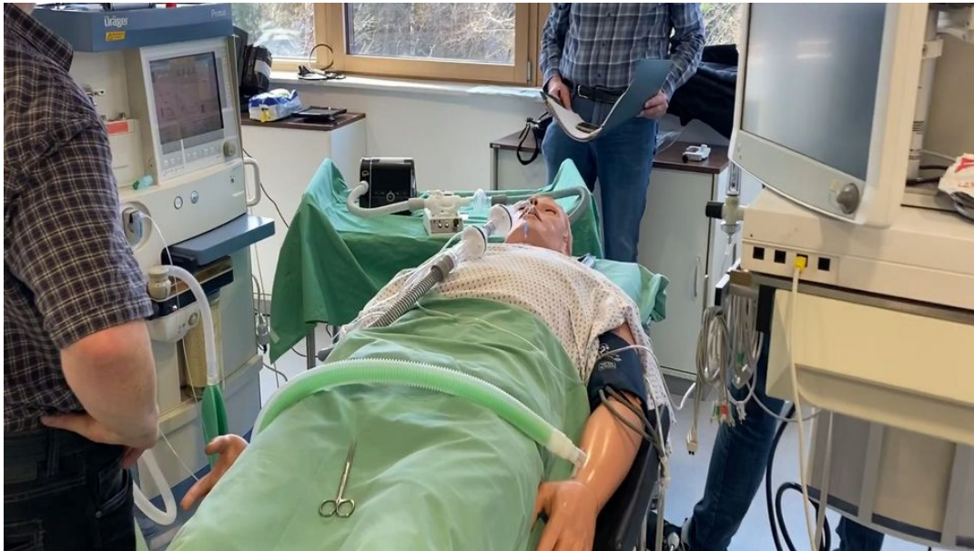
Researchers and medical professionals from the University of Marburg use a dummy to test the ventilator.