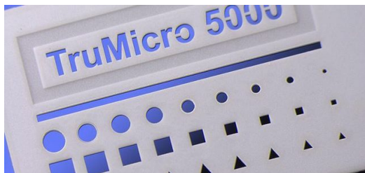
With regard to bezels and watch casings made of ceramic: no tool other than an ultrashort laser beam can create contours like these with such speed and precision.