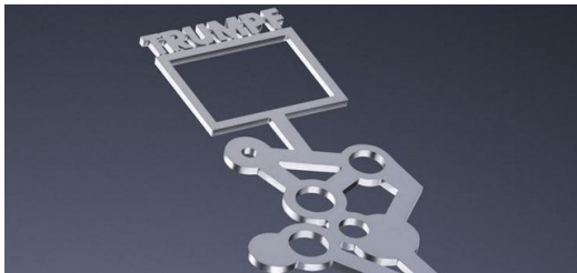
In fusion cutting, the material melts into the kerf while shielded by an inert gas and the molten material is forced out by the gas pressure.