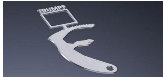
The variety of materials in precision cutting applications ranges from stainless steel – as seen here – to copper alloys and synthetic rubies for jewel bearings.