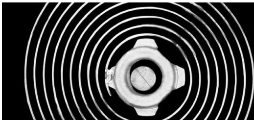
One of the first industrial laser applications: laser-welded watch springs.