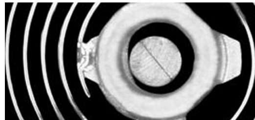
The welding spot has a diameter of 0.2 millimeters.