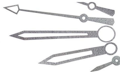
Cutting to specification with an ultrashort pulse laser: watch hands made of 0.05 millimeter thick stainless steel. The slotted recesses provide space for a subsequent application of fluorescent material.