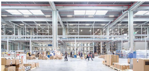
The new TRUMPF logistics center has a surface area of 13,000 square meters, a ceiling height of 18 meters, and delivers more than 60,000 stock items per month.

The blue crate containing the ordered laser nozzles has arrived at the packaging station, after traversing the building on a conveyor belt. The distance traveled depends on the number of other orders being processed at the same time, and which ones have priority. The logistics center is very flexible in this respect: an ingenious combination of automated and manual warehouse management processes makes it possible to respond rapidly to changes such as fluctuating order volumes and still deliver the merchandise as quickly as possible.