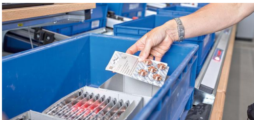
Order Preparation.