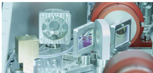
<div class="indent">Optics for laser amplifier in science. </div>

Ultimately there's one key thing that any potential entrepreneur needs to remember: if you're looking for an idea that amounts to more than just lines of code, you would be wise to take a careful look at what lasers can do. Or think carefully about what people who work with lasers need. Or at least mull over what lasers can do to help people who are planning something new – or who are simply looking to save the world.