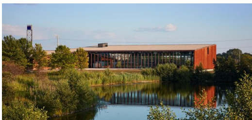
Chicago was consciously chosen as the location for the Smart Factory. The directly adjacent states contain around 40 percent of the country's entire sheet metal working industry.

When a working factory is set up in a showroom, manufacturing processes come alive. Once again, TRUMPF has gone to extraordinary lengths not only by creating a hands-on experience of connected production but also by framing it in a futuristic vision that offers revolutionary perspectives. A control room equipped with numerous monitors, many of them transparent, looks directly out over the shop floor and all the machinery. And an elevated walkway spanning the entire production hall provides a bird's-eye view of the digitally connected facility. TRUMPF's smart factory in Chicago shows the modern face of sheet metalworking using the latest tools. Unlike other demonstration centers which focus on individual products, here visitors can see the fully orchestrated interaction between elements in the production system. The Chicago demo center enables customers to visualize their entire value chain and even simulate their own job schedules.