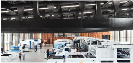
In a production hall measuring 55 meters in length, there is a connected sheet metal production with a central storage system as the centerpiece, which supplies the machine tools with material.