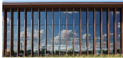
The focus of the Smart Factory is to advise and train customers on the introduction of digitally connected production solutions.