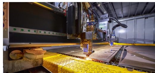
Two cutting heads equipped with 0.5 and 1 mm fibers can cut individually or in parallel (Photos: Norbert Voskens).