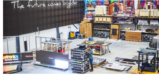
<p>Tailor-made: Apametal develops and builds each digital sign itself.</p> – Frederik Dulay-Winkler