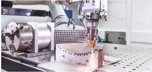
Time to process the order – a TRUMPF laser applies a metal layer onto a tool for a press in the automotive industry.