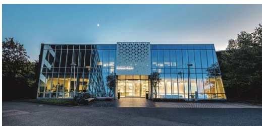
<p>Customer center: TRUMPF impresses customers with its combination of outstanding industrial architecture and superb product quality.</p>