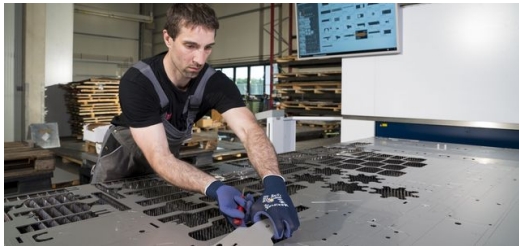
Today, all it takes is a glance at the Sorting Guide screen. The operator is shown a removal proposal on the large screen. All parts that belong to an order are color-coded.