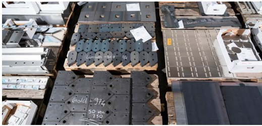
Every week, Rolf Lasertechnik GmbH & Co KG produces around 2,500 laser blanks and processes around 6,000 metric tons of raw material for this purpose.