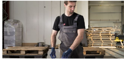
In the past, sorting out laser-cut parts was tedious puzzle work for operators. Printed views of the nesting programs served as orientation.