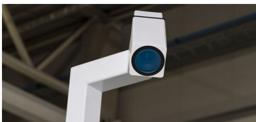
A high-resolution camera captures every part that is removed. The intelligent image processing of the Sorting Guide reliably detects it and reports the removal to the TruTops Fab production control.