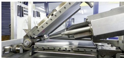
Despite the lack of space between the baking plates, the laser cleans them quickly and reliably.

Having now found the right tool and process, the next step for Kalss was retrofitting the laser for its new day job as a cleaning agent in a wafer factory. He called on systems integrator Robert Binder to help him solve a seemingly contradictory problem. “In our ovens, the baking plate pairs only open up to an angle of 30 degrees. This prevents excessive heat loss when the batter is poured in or the wafer sheets are removed,” says Kalss. “But in order to clean our ovens, we require the surfaces to be as accessible as possible.”